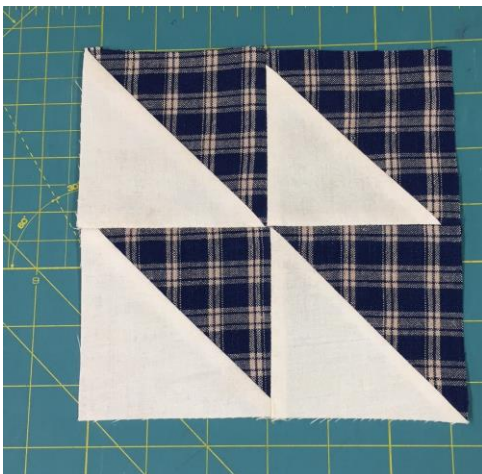
Finished Little Cedar Tree Block for October.

Sew the squares together in rows, then the rows together to create your block.