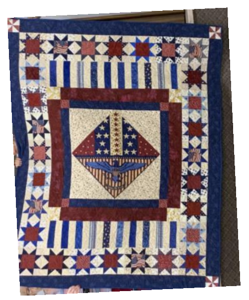
Quilts of Valor