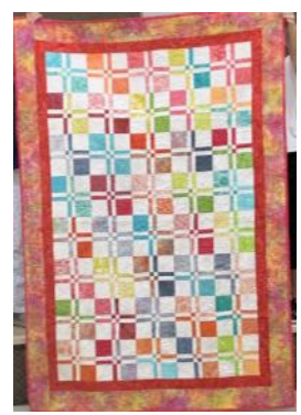
August block party is a disappearing 4 patch. Instructions are on <u>You Tube</u> under Missouri Star Quilt Co also Google Disappearing 4 patch tutorial. Use two white squares and two batik pastels