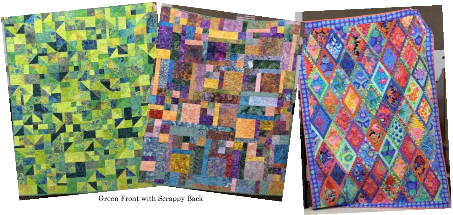
Green Front with Scrappy Back