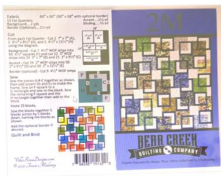
Bear Creek Quilting from Lebanon Oregon sent us a welcoming packet of patterns and invitation to visit their store or order online,