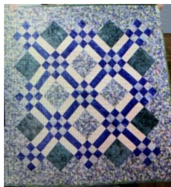
Comfort Quilts from Colfax Ladies